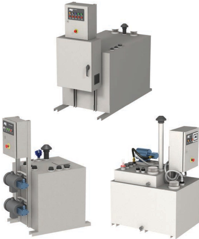
*Note: Tank type and configuration may vary.

The AXI Ready-Use Fuel Tank is a fuel storage tank constructed to customer specifications with various designs ranging from single wall or double wall construction, per UL-142 specifications, to fire safety tanks, per UL-2085 specifications. The tanks are available with pumps for transferring fuel to and from the storage tank. All tanks are designed with a interstitial wall to capture leaks and alert the user of an issue. All tanks are primed and finish coated to customer specification.