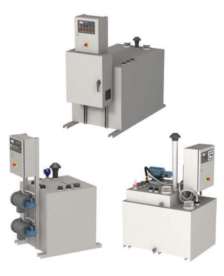
*Note:Tank type and configuration may vary.

The AXI Ready-Use Fuel Tank is a fuel storage tank constructed to customer specifications with various designs ranging from single wall or double wall construction, per UL-142 specifications, to fire safety tanks, per UL-2085 specifications. The tanks are available with pumps for transferring fuel to and from the storage tank. All tanks are designed with a interstitial wall to capture leaks and alert the user of an issue. All tanks are primed and finish coated to customer specification.